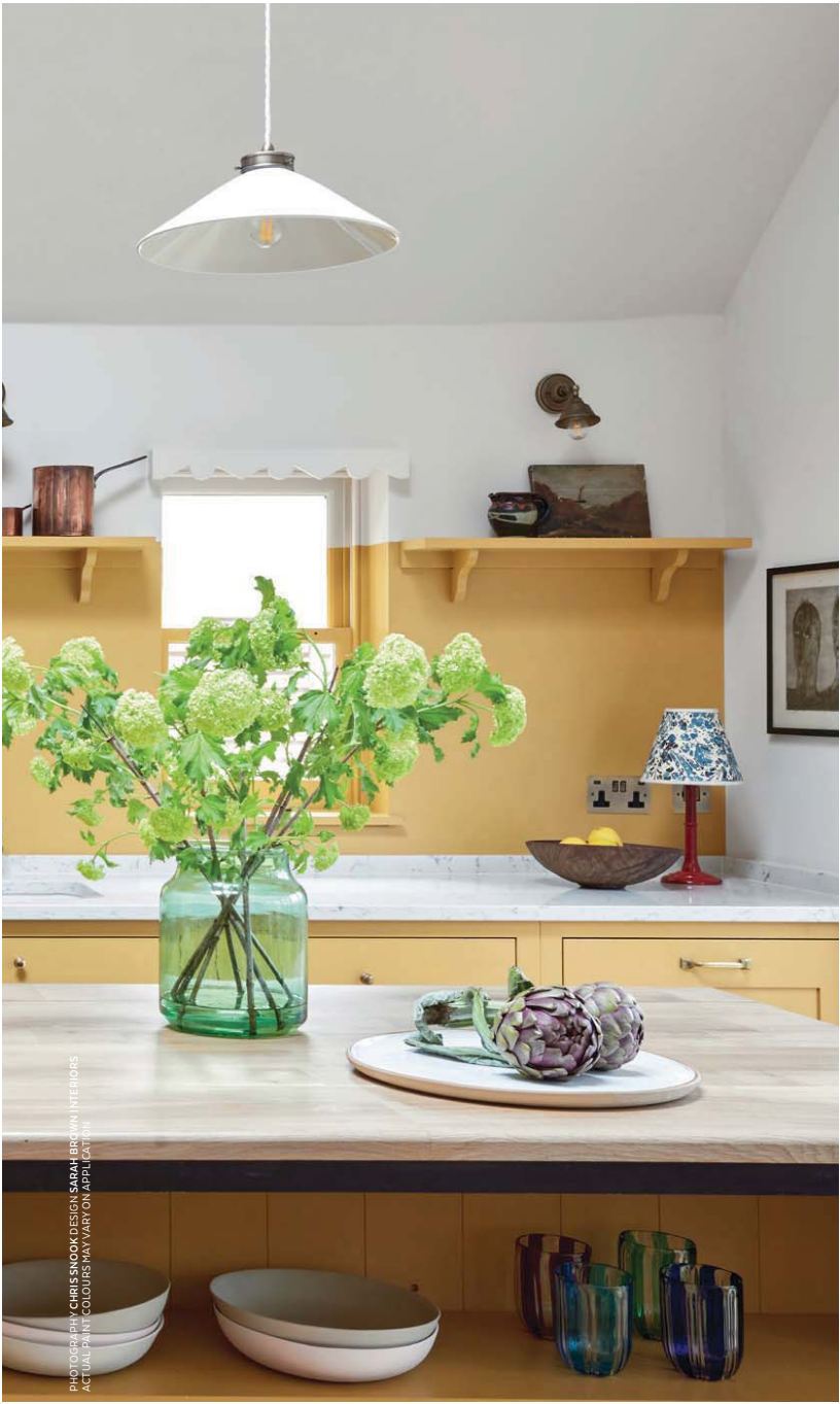
DESIGN SARAH BROWN INTERIORS ACTUAL PAINT COLOURS MAY VARY ON APPLICATION

Butter it up This joyful, sunny kitchen can be found on the ground floor of a Victorian terrace in the leafy village of Chiswick, London. Interior designer Sarah Brown applied a buttery yellow hue to the walls and cabinetry to add light, warmth and zest to the interiors. Crisp white, scallop-edge awnings and a marble-look Silestone Lyra kitchen countertop (which you can find at Cosentino) balance the colour saturation. A variety of lighting options, from the overhead pendants to old-world wall sconces and the charming benchtop lamp, are simultaneously stylish and functional, conjuring a range of ambient moods or task lighting to suit the owner's needs – whether cooking, entertaining or just savouring a coffee. The island is a reclaimed worktop and features open shelves finished in that same shade of yellow, a cohesive backdrop to the tableware, which is on display. Accents of black on the island walls and range cooker add depth and contrast, while the timber countertop of the island provides an organic feel. Brimming with character, this tranquil kitchen showcases the homeowners' own artwork for a personal touch.